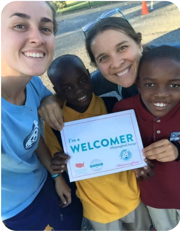
Soccer Without Borders