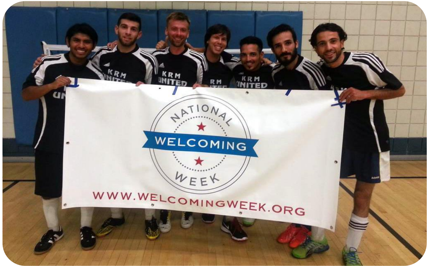
Kentucky Refugee Ministries